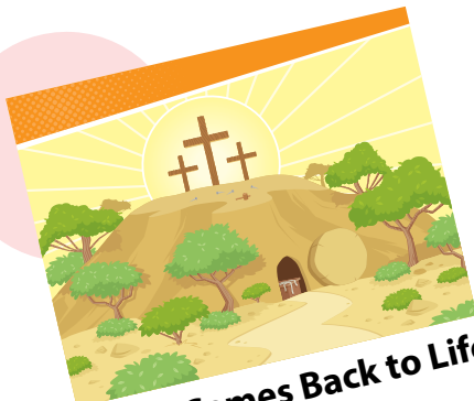
Jesus Comes Back to Life Matthew 28