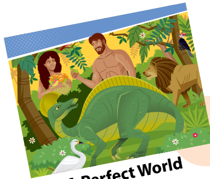
A Perfect World Genesis 1–2