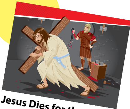
Jesus Dies for the World Matthew 27; John 3:16