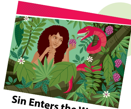
Sin Enters the World Genesis 3:1–13