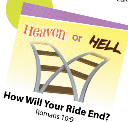
How Will Your Ride End? Romans 10:9