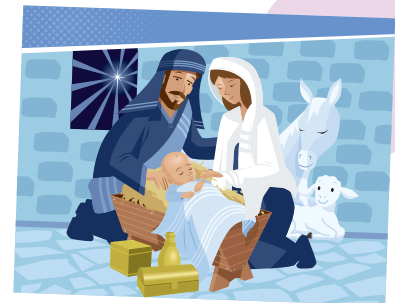
Jesus Comes to the World Luke 2